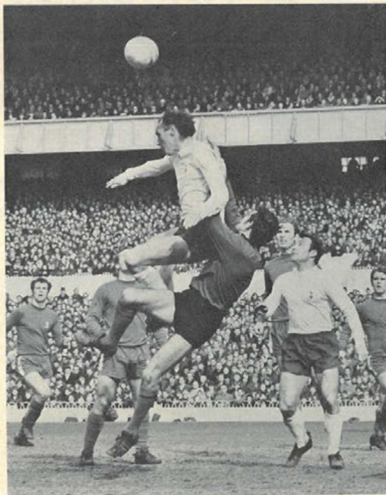
Spurs v. Chelsea. An anxious moment for Chelsea's defence.