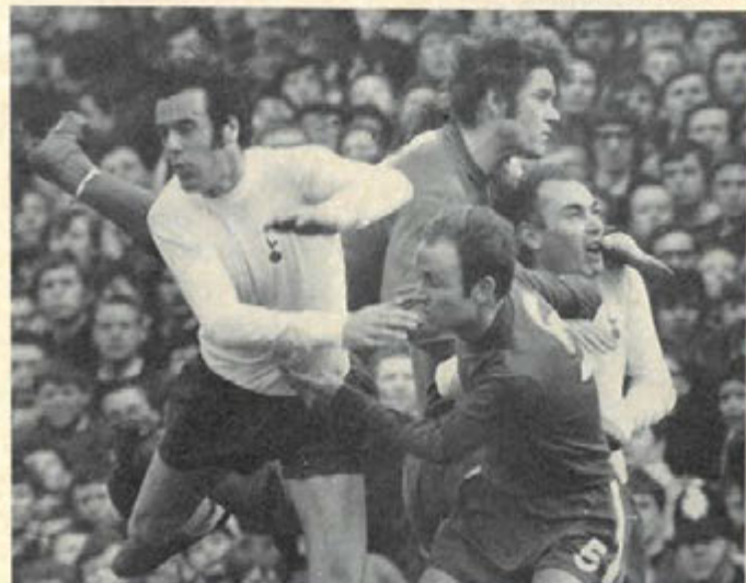
A study in facial expressions following a corner to Spurs.