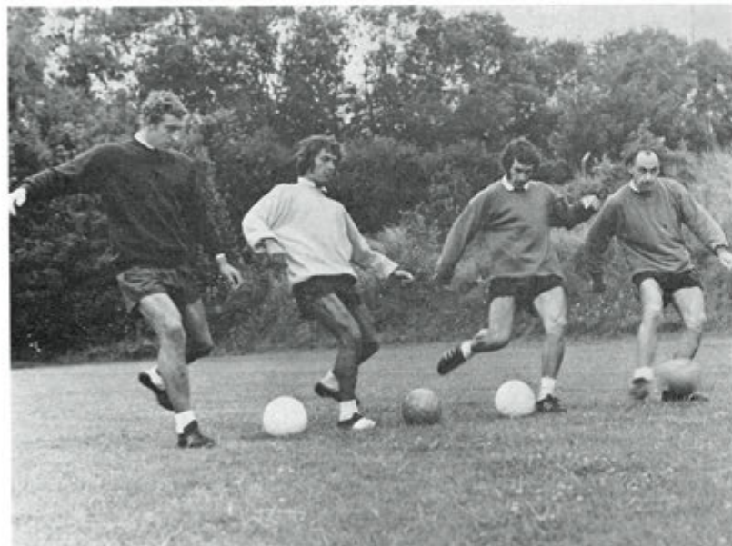
A study in concentration featuring from the left Martin Chivers, Roger Morgan, Jimmy Pearce and Alan Gilzean.