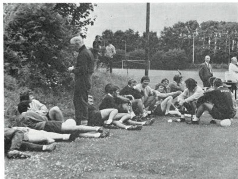
A welcome break for rest and refreshment.