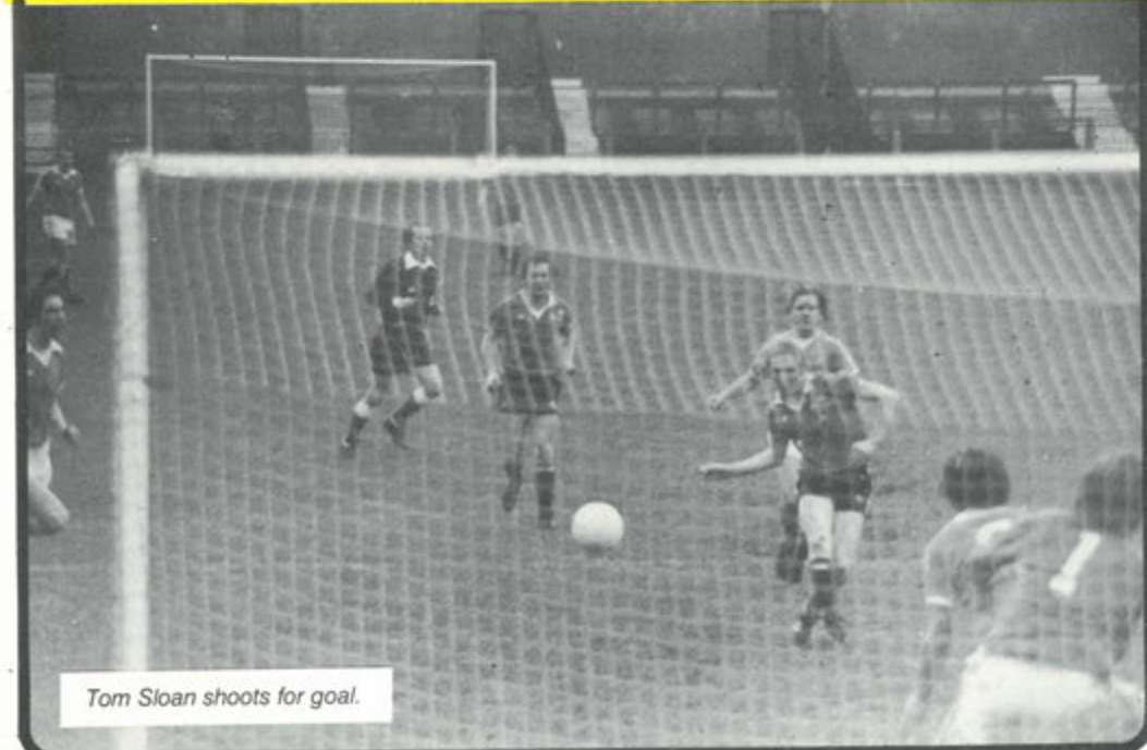
Tom Sloan shoots for goal.