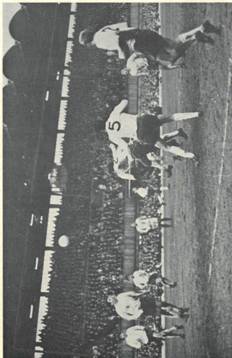
Coventry City v. Spurs. Spurs' defence at the alert in the match at Highfield Road.