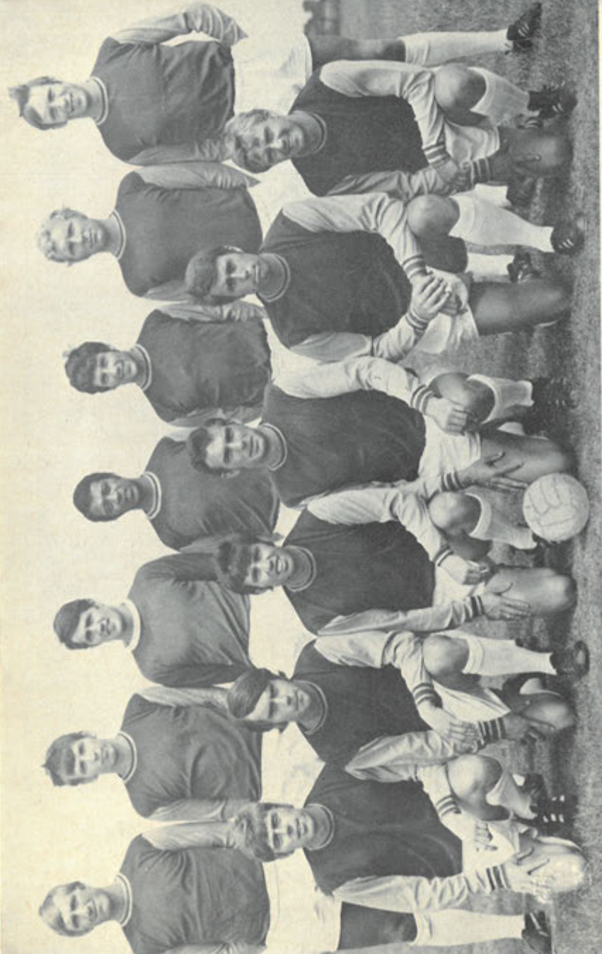
West Ham United, 1969-70. Back row, left to right: Billy Bonds, Martin Peters, Bobby Ferguson, John Charles, Bobby Howe, Bobby Moore, Alan Stephenson. Front row, left to right: Harry Redknapp, Jimmy Lindsay, Ron Boyce, Trevor Brooking, Geoff Hurst, John Sissons.

Winger John Sissons , from Hayes in Middlesex, has 10 England Under-23 caps. He has been a full pro. with the Hammers since October 1962.