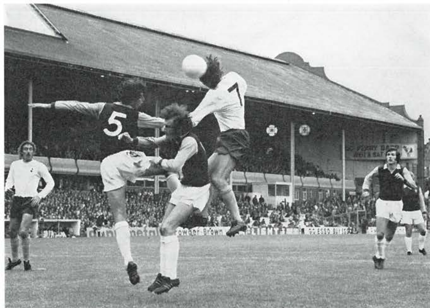
Alan Gilzean leaps above the Villa defenders to head for goal, in the pre-season friendly match at Villa Park.