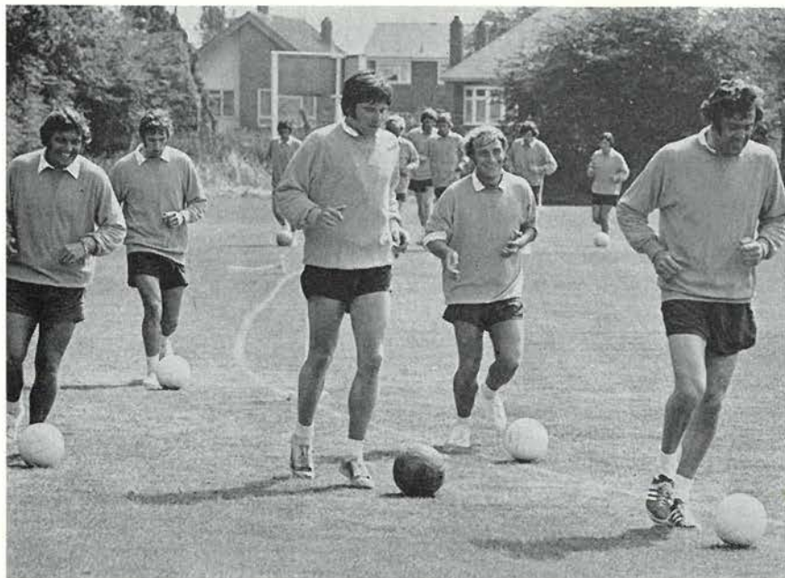
A pre-season training session in progress at Cheshunt.