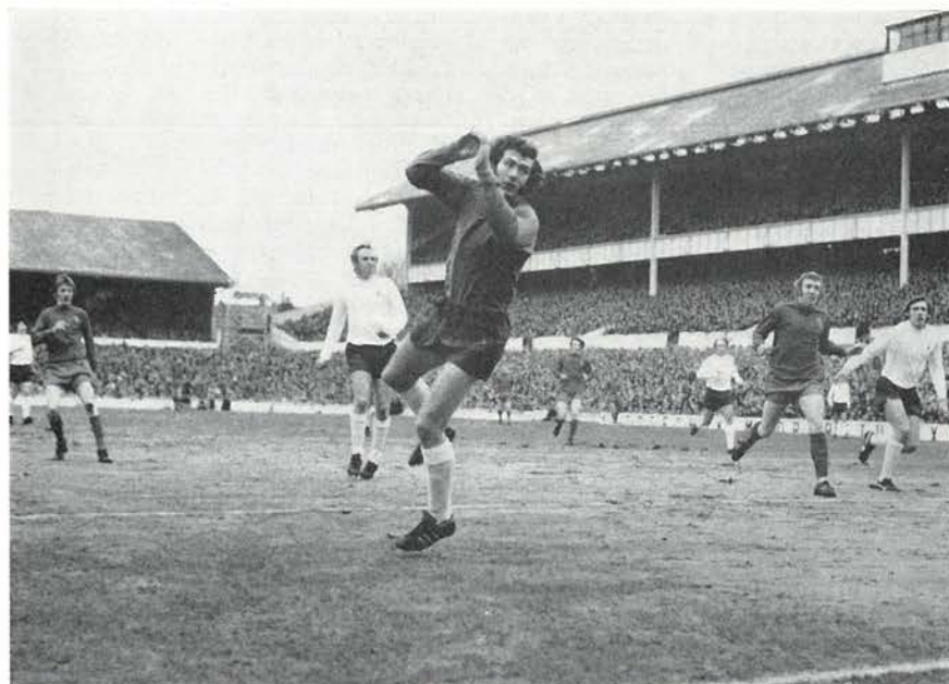
Spurs' defence looks anxiously on as a Leeds' shot passes close to our goal.