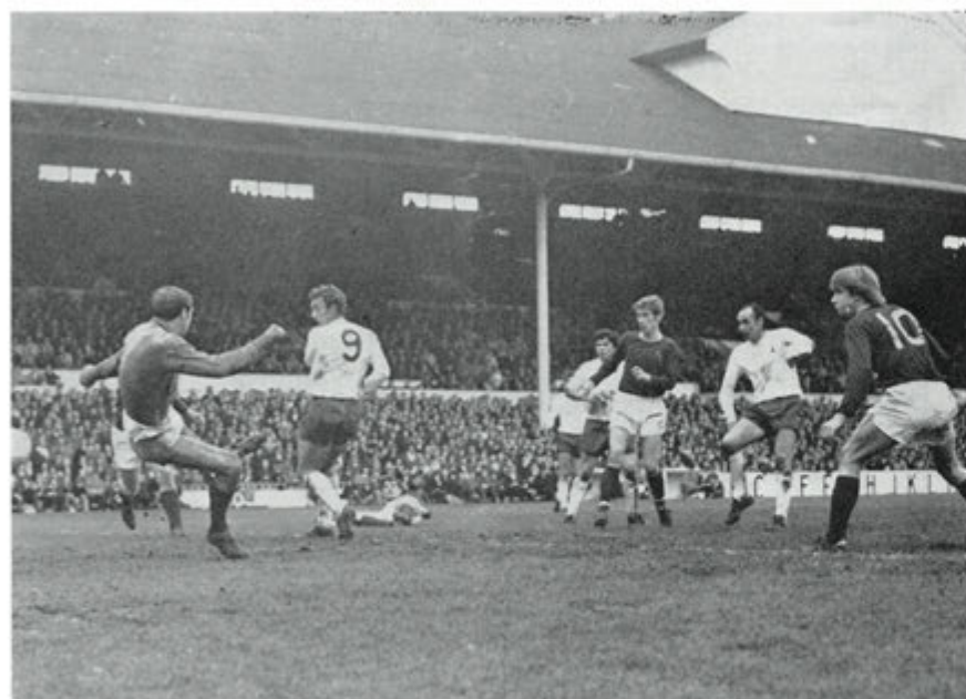
Waiters appears to be caught off-balance as Alan Gilzean scores Spurs' fourth goal.