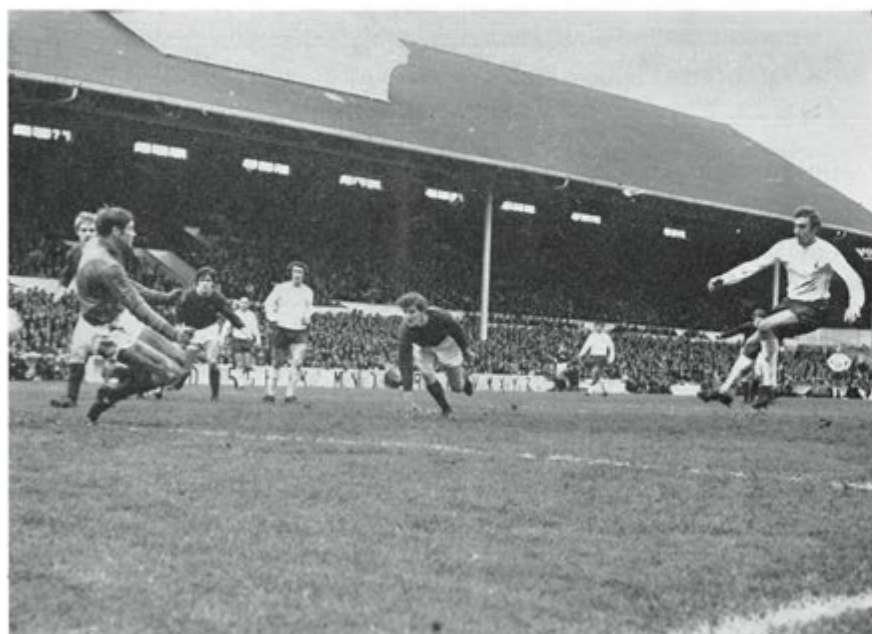
Martin Chivers drives the ball past Tony Waiters, Burnley's goalkeeper, to score Spurs' second goal.