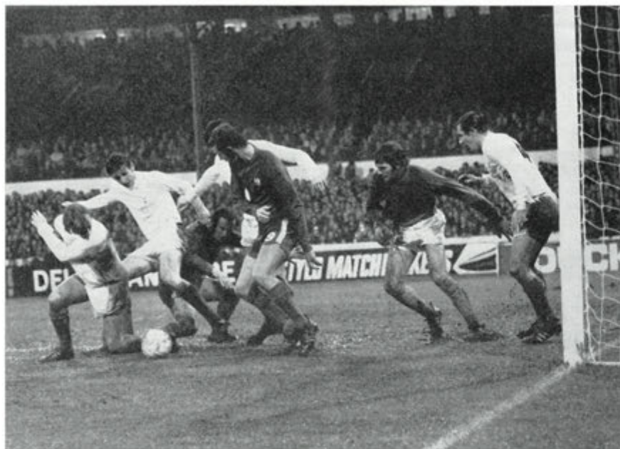
Chelsea v Spurs. Every eye is glued to the ball in this goalmouth melee at Stamford Bridge.