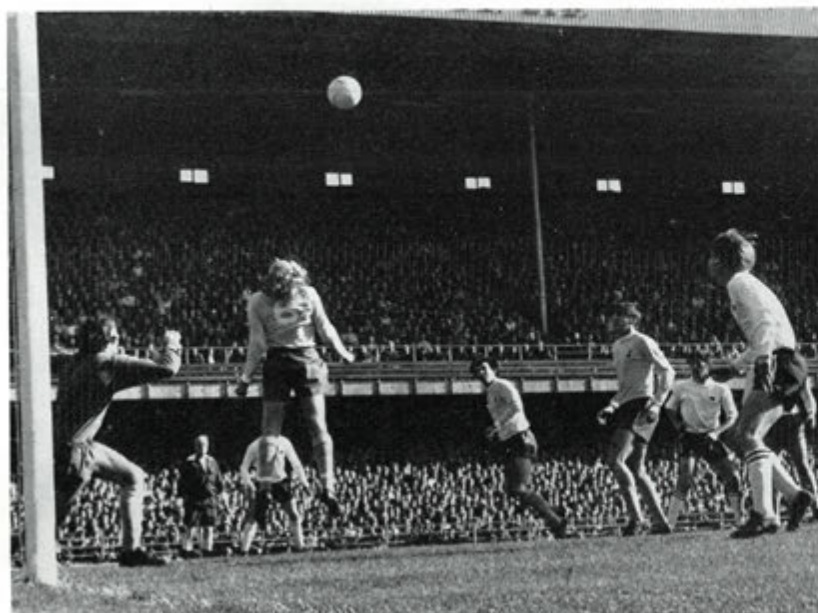
An awkward moment but Spurs' defence coped with this situation.