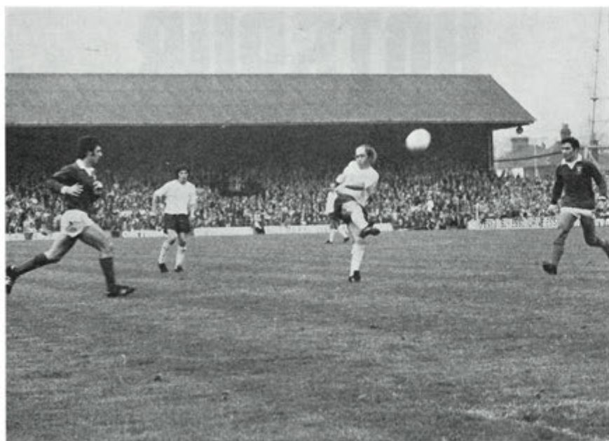
This volley by Ralph Coates flies over the bar.