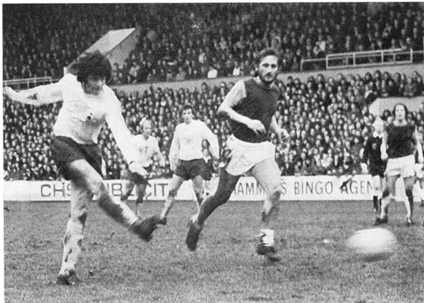
Bottom: Another, but less successful, attack by Spurs in the same match. The result was a 1—1 draw.