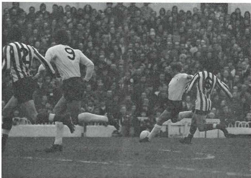
Ralph Coates shoots for goal as Southampton's Tony Byrne attempts to intercept.