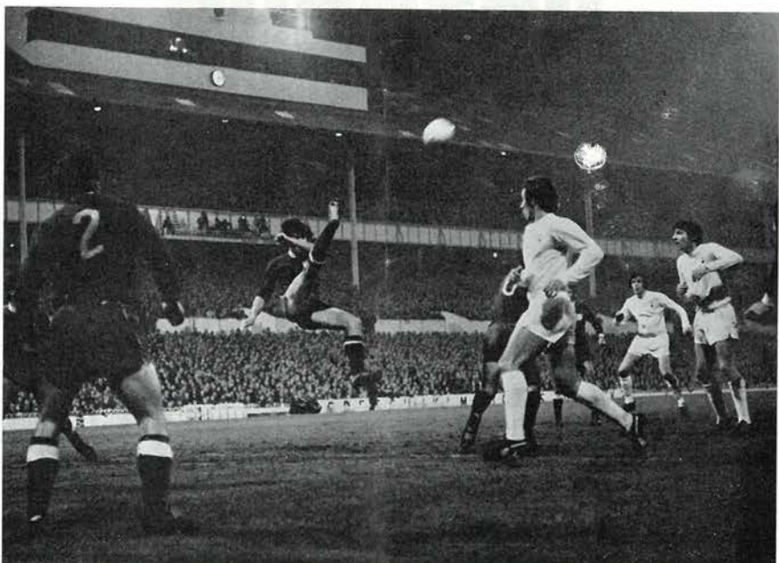
One of the many anxious moments for Rapid as a defender makes an acrobatic clearance. 33