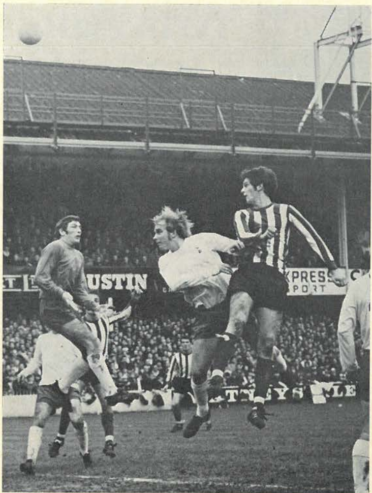
Southampton v. Spurs. An awkward moment for Spurs' defence at the Dell.