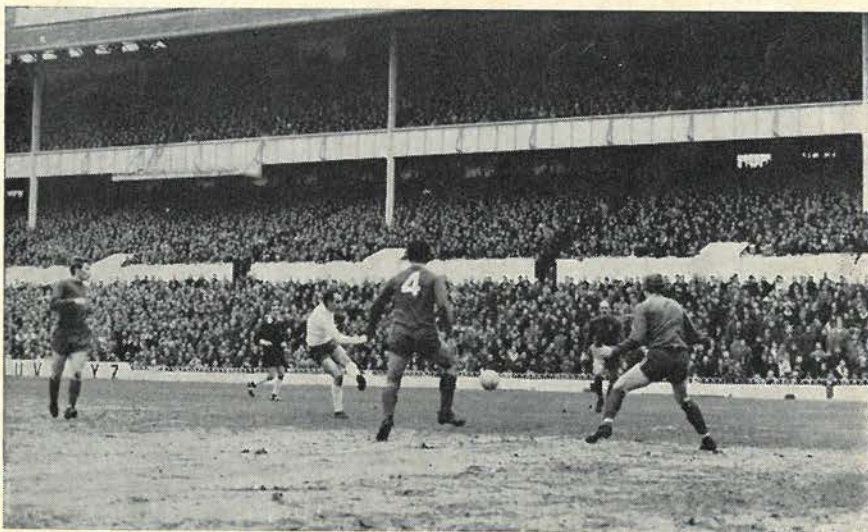
Alan Gilzean shoots as Sunderland's defence closes in.